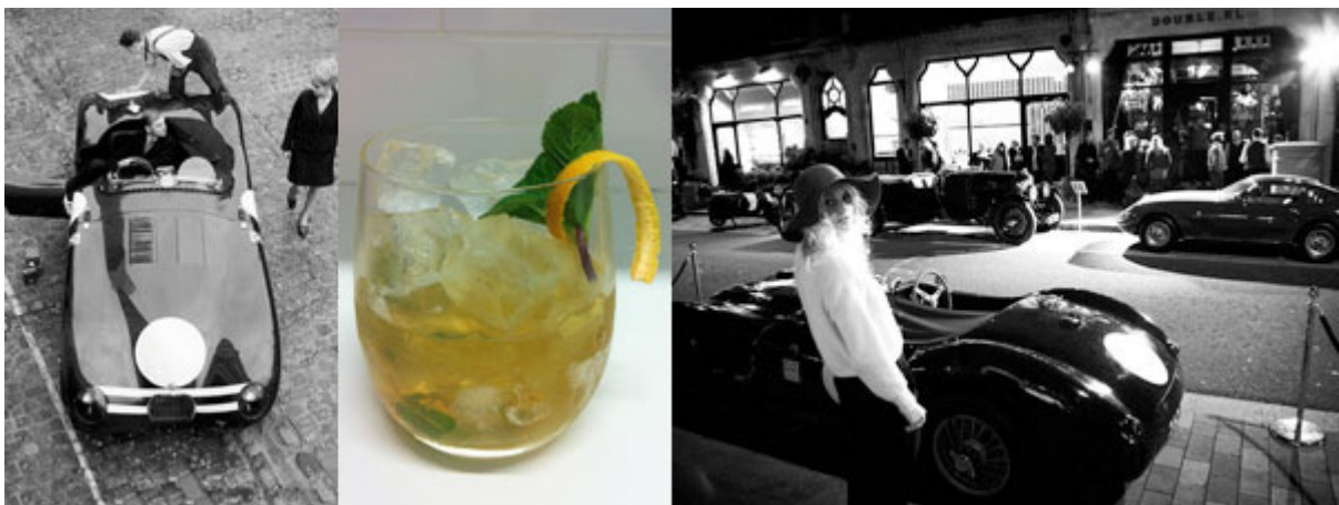
Table Talk served a selection of bespoke canapés including corn muffins with a guacamole and tomato salsa and mini beef Wellingtons with foie gras parfait, all inspired by Ricky Lauren's new Double RL cookbook. The night of Historic Cars and RRL Ranch photographs at the RRL store on Mount Street, celebrated Ralph Lauren's vintage-inspired line with Fiskens vintage automobiles parked outside the store. We put a bespoke spin on a classic Old Fashioned creating a Double RL house cocktail which went down a storm with the trendy vintage-clad guests.