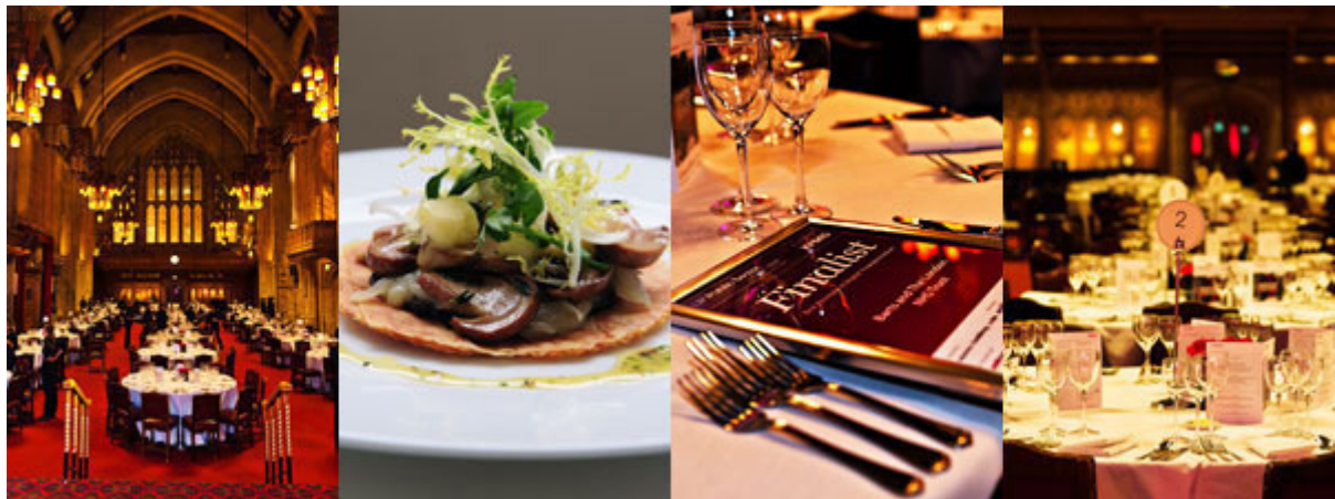
Table Talk, in collaboration with Sift Media, proudly hosted its debut event at Guildhall this month, serving food for the UK Public Sector Digital Awards Dinner. The 15th century building created a grand setting for the evening where highlights included a video message from The Deputy Prime Minister Rt. Hon Nick Clegg as well as an informative speech by The Cabinet Office Minister The Rt Hon Francis Maude MP. For further information about the event please click here .